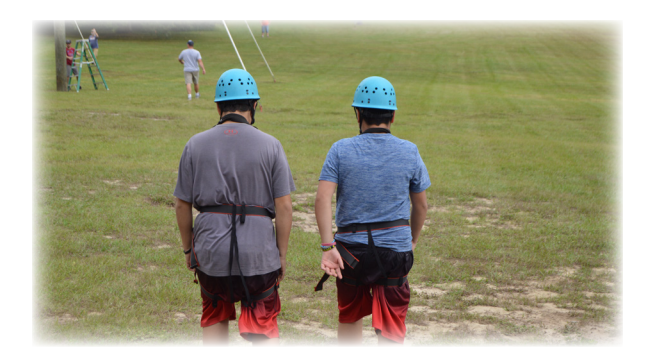
Make it happen... Together!

make a craft, paddle a canoe, ride a zipline, walk a trail, pray together, take a trust walk, sing around a campfire, get sticky with s'mores, watch a falling star, read God's Word & experience His creation... together.